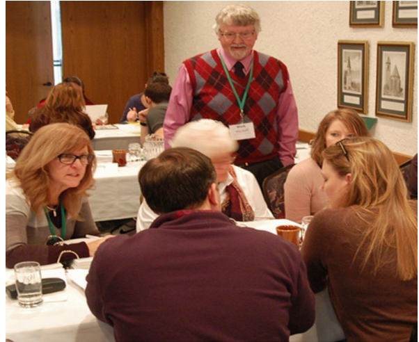
Local Leadership groups discuss zoning and planning needs.

MSU Extension provides accurate information on basic planning and zoning techniques, as well as current “best practices.” Classes address land use, community development, and environmental issues facing Michigan communities today. Extension educators assisted over 20 local officials in Oceana County by offering training in planning and project management, funding tools, budgeting, and record keeping.