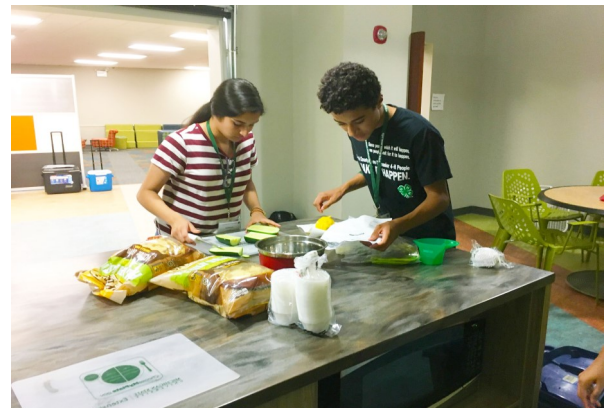
Kids learn to make healthy snacks during “Cooking Matters for Teens.”

MSU Extension's Supplemental Nutrition Assistance Program provides basic nutrition education and hands-on activities for all ages. Core curricula are designed to help low-income families stretch their food dollars while maintaining good nutrition. Some instruction includes physical activity and cooking techniques that help instill life-long skills. It is estimated that every $1 spent on nutrition education saves as much as $10 in long-term health costs.