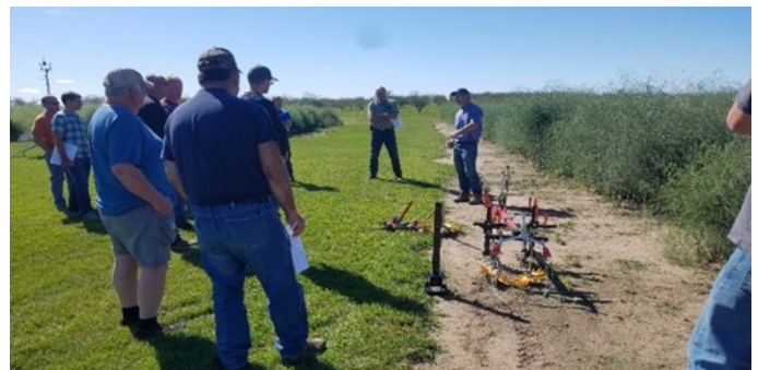
Drone demonstration in Hart, during Oceana research station tour.

From Tree Fruit School to supporting the Midwest Chestnut Producers, and from researching Fruit Tree disease resistance to managing disease and insect issues, the fruit and vegetable growers recognize the importance of a strong Extension presence in the area. In 2019, over 415 Oceana County residents participated in tree fruit/nut workshops and training series. The biggest of these interactions in Oceana County was the spring horticulture meeting, hosted in Shelby, and attended by over 100 fruit farmers from the area.