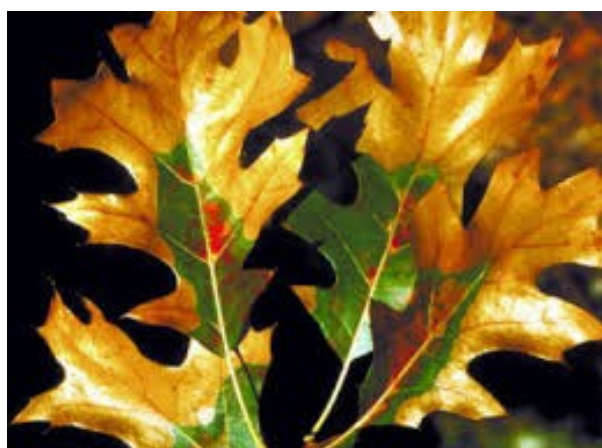
One of the many plant disease samples brought into the Extension office for identification.