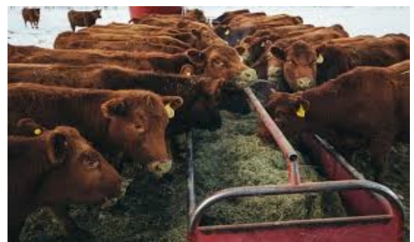
Beef and dairy farms benefitted from consultation visits from MSU Extension educators

Providing support to dairy and beef farms in Oceana County resulted in improved quality of livestock, savings on investment in feed, and time-saving efficiencies, all of which result in better financial performance. Other farm visits in Oceana County focused on succession planning with farm financial analysis, Farm Bill education sessions, and Farm Stress consultations.