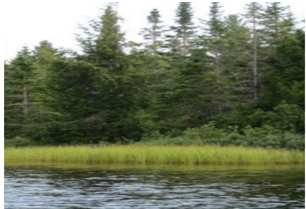
Research on inland lakes in Oceana County provides data for statewide reports.

MSU Extension’s focus on lakes, streams, and watersheds brings together educators and researchers with local, state, regional, and federal agencies and stakeholder organizations to protect and promote the sustainable use of the state’s distinctive aquatic resources. In 2019, Oceana County projects included invasive species identification, herbicide research, shoreline preservation, and more.