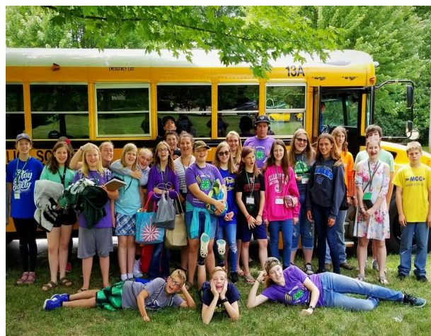
4-H members heading off to Lansing for Exploration Days at MSU.